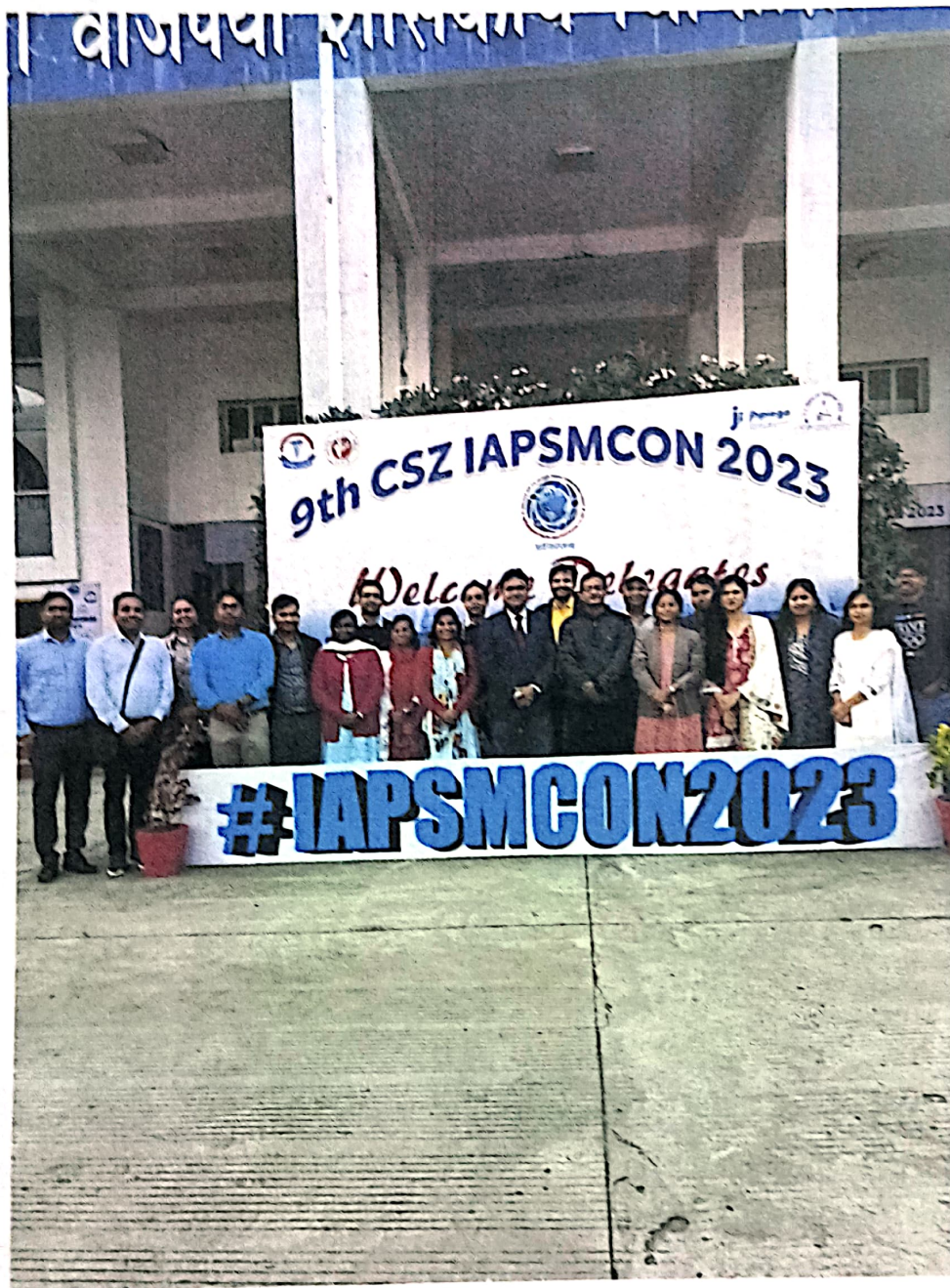
Entire team of Pt. J.N.M. Medical College, Raipur at Atal Bihari Vajpayee, Government Medical College, Vidisha, Madhya Pradesh for CSZ- IAPSMCON 2023